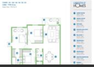
1750 Sq Ft