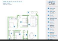
1735 Sq Ft