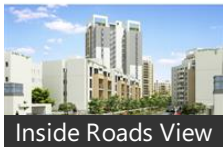
Inside Roads View