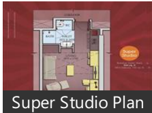
Super Studio Plan