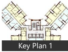
Key Plan 1