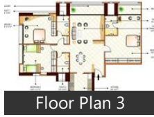
Floor Plan 3