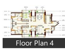
Floor Plan 4