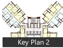
Key Plan 2