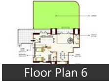
Floor Plan 6