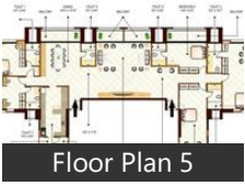
Floor Plan 5