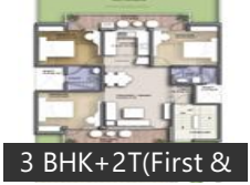
3 BHK+2T(First &