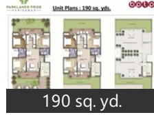
190 sq. yd.