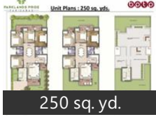
250 sq. yd.