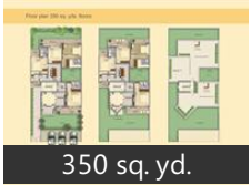
350 sq. yd.