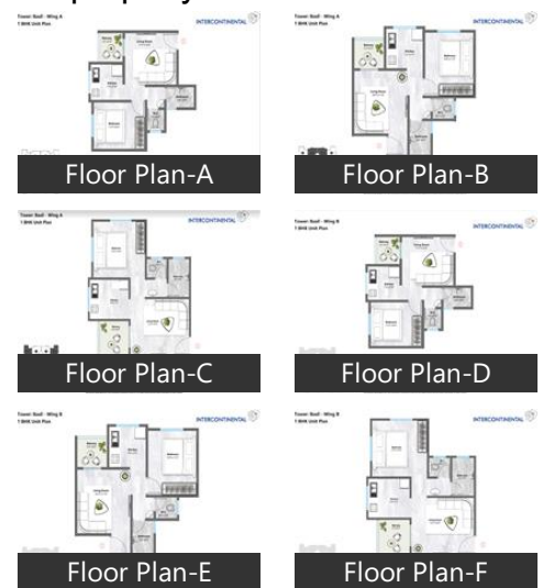
* These floor plans are of the project and might not represent the property