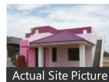
Actual Site Picture