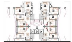
2 BHK 604 Sq. Ft.

* These floor plans are of the project and might not represent the property