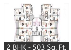
2 BHK - 503 Sq. Ft.