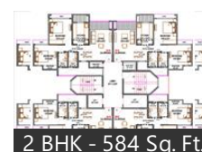
2 BHK - 584 Sq. Ft.