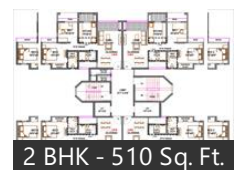
2 BHK - 510 Sq. Ft.