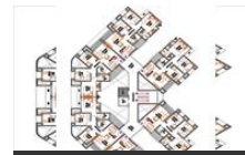
2 BHK Floor Plan