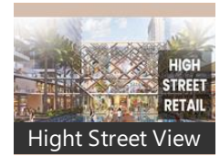
High Street View

* These pictures are of the project and might not represent the property