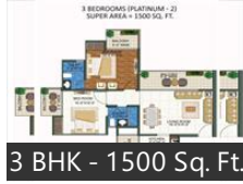
3 BHK - 1500 Sq. Ft.