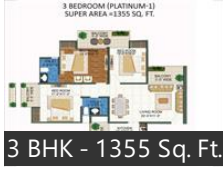
3 BHK - 1355 Sq. Ft.