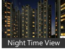
Night Time View