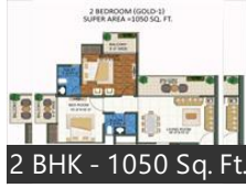
2 BHK - 1050 Sq. Ft.