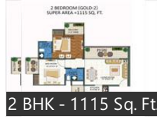
2 BHK - 1115 Sq. Ft.