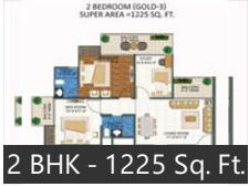
2 BHK - 1225 Sq. Ft.