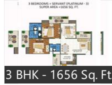
3 BHK - 1656 Sq. Ft.