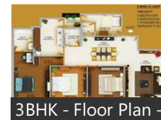
3BHK - Floor Plan -