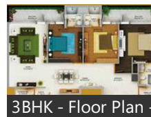
3BHK - Floor Plan -