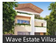
Wave Estate Villas