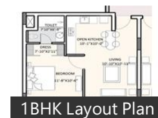
1BHK Layout Plan

* These floor plans are of the project and might not represent the property