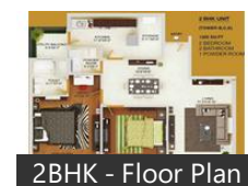
2BHK - Floor Plan