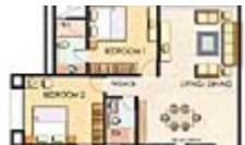
2BHK-A Floor Plan