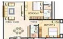
2BHK-B Floor Plan