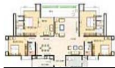
4BHK Floor Plan