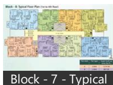
Block - 7 - Typical