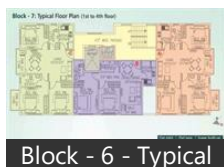
Block - 6 - Typical