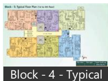
Block - 4 - Typical