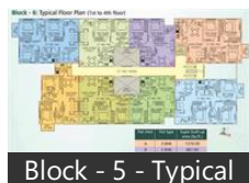
Block - 5 - Typical