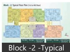
Block -2 -Typical