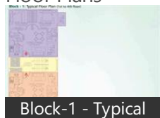
Block-1 - Typical