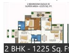
2 BHK - 1225 Sq. Ft.