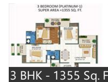
3 BHK - 1355 Sq. Ft.

* These floor plans are of the project and might not represent the property