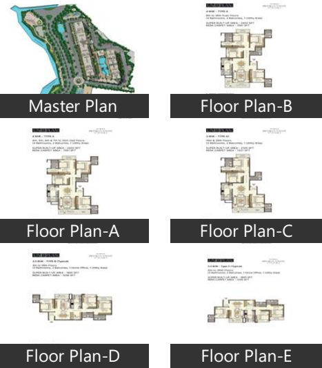
* These floor plans are of the project and might not represent the property