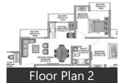
Floor Plan 2