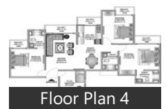
Floor Plan 4

* These floor plans are of the project and might not represent the property