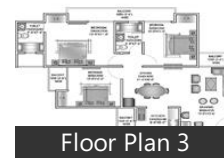
Floor Plan 3