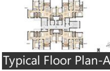
Typical Floor Plan-A