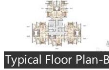
Typical Floor Plan-B