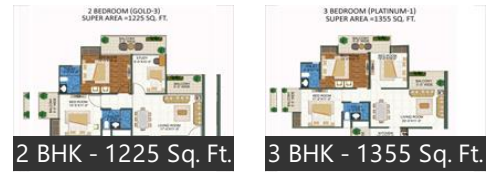
* These floor plans are of the project and might not represent the property

Pros: The region has a good network of roads and offers good connectivity to both Delhi and Noida. The pro Cons: its good area Posted: Sep 18, 2022 by Jai Kumar (Shourya Group)