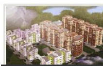
Bird Eye View