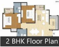
2 BHK Floor Plan