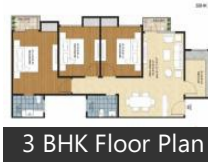
3 BHK Floor Plan