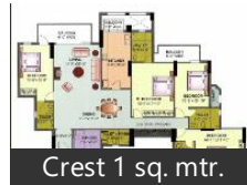
Crest 1 sq. mtr.