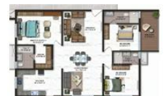
2656 sft Floor plan