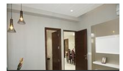
Master Bed Room