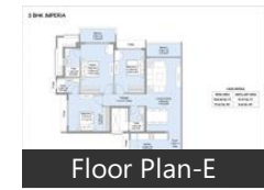
* These floor plans are of the project and might not represent the property