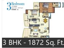
3 BHK - 1872 Sq. Ft.