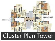
Cluster Plan Tower