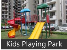
Kids Playing Park