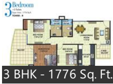
3 BHK - 1776 Sq. Ft.