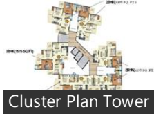
Cluster Plan Tower