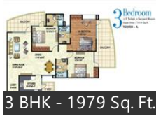
3 BHK - 1979 Sq. Ft.