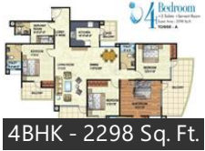
4BHK - 2298 Sq. Ft.