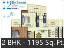
2 BHK - 1195 Sq. Ft.