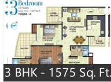
3 BHK - 1575 Sq. Ft.