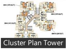
Cluster Plan Tower