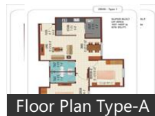
Floor Plan Type-A