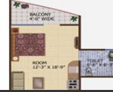
1BHK - 575 Sq. Ft.