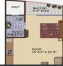
1BHK - 595 Sq. Ft.