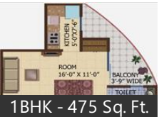
1BHK - 475 Sq. Ft.