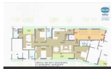
Floor Plan Block B