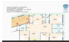
Floor Plan Block B-1