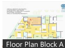
Floor Plan Block A