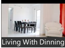
Living With Dinning