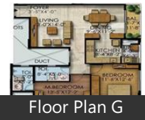
Floor Plan G