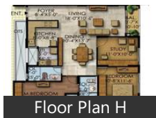
Floor Plan H