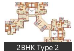
2BHK Type 2