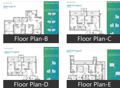
* These floor plans are of the project and might not represent the property