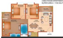
3BHK 1150 Sq.Ft