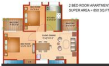
2BHK 850 Sq.Ft