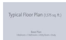
Typical Floor Plan (1,175 sq. ft.)