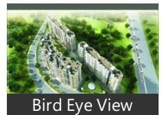
Bird Eye View

* These pictures are of the project and might not represent the property