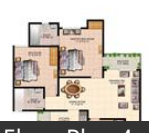
Floor Plan 4

* These floor plans are of the project and might not represent the property