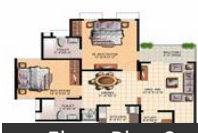
Floor Plan 2