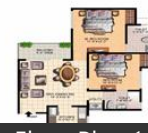
Floor Plan 1