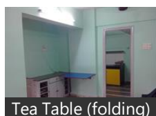
Tea Table (folding)