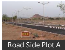
Road Side Plot A