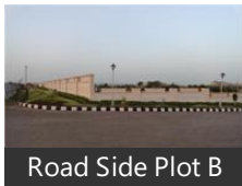
Road Side Plot B