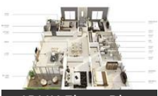
4BHK Floor Plan