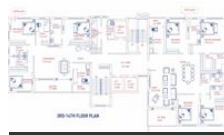
3 RD - 14 TH Floor