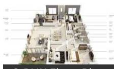
3 BHK Floor Plan