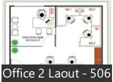
Office 2 Laout - 506