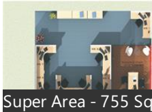
Super Area - 755 Sq