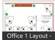
Office 1 Layout -