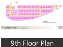
9th Floor Plan