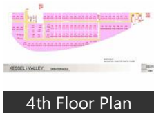
4th Floor Plan