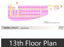
13th Floor Plan