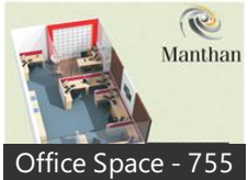
Office Space - 755