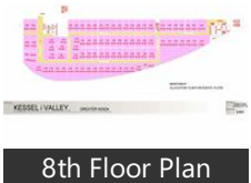
8th Floor Plan