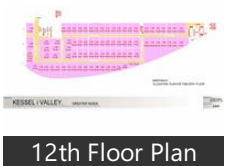
12th Floor Plan