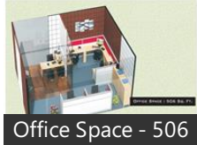
Office Space - 506