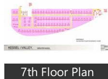
7th Floor Plan