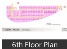
6th Floor Plan