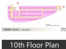
10th Floor Plan