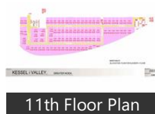
11th Floor Plan