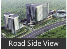
Road Side View