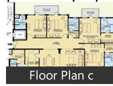
Floor Plan c