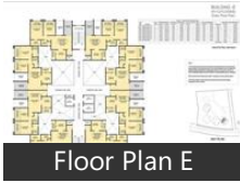
Floor Plan E