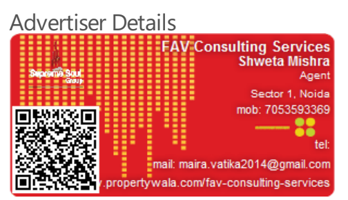
Scan QR code to get the contact info on your mobile View all properties by FAV Consulting Services