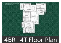
4BR+4T Floor Plan

* These floor plans are of the project and might not represent the property