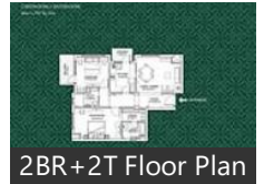
2BR+2T Floor Plan