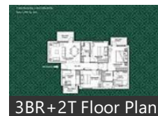
3BR+2T Floor Plan