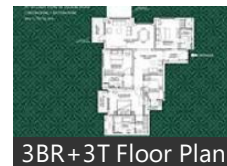
3BR+3T Floor Plan