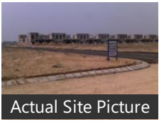
Actual Site Picture