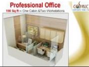
Professional Office -