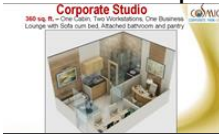
Corporate Studio -