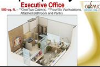
Executive Office -