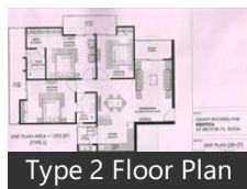
Type 2 Floor Plan