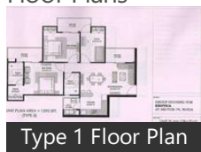
Type 1 Floor Plan