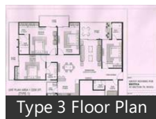
Type 3 Floor Plan