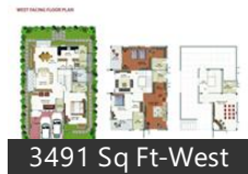
3491 Sq Ft-West