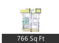
766 Sq Ft