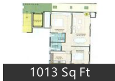
1013 Sq Ft