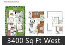
3400 Sq Ft-West