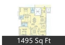
1495 Sq Ft