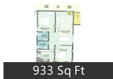
933 Sq Ft