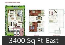
3400 Sq Ft-East