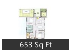
653 Sq Ft