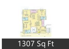
1307 Sq Ft