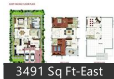
3491 Sq Ft-East