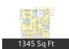
1345 Sq Ft