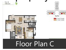
Floor Plan C