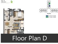
Floor Plan D