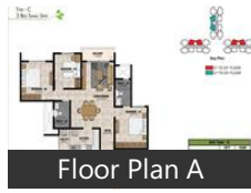
Floor Plan A