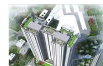
Birds Eye View