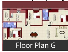
Floor Plan G