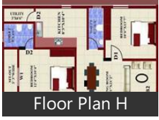
Floor Plan H